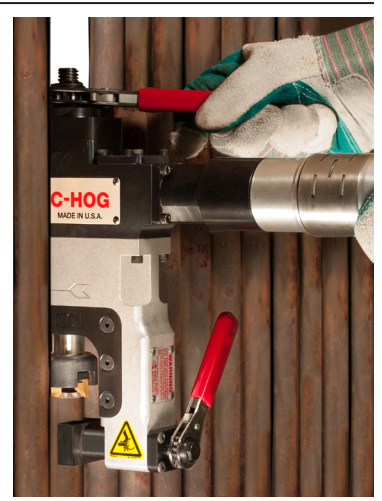
This rugged tool has a narrow profile and can fit between 1.25" O.D. membrane water wall boiler tubes to bevel a single tube for a Dutchmen tube repair.