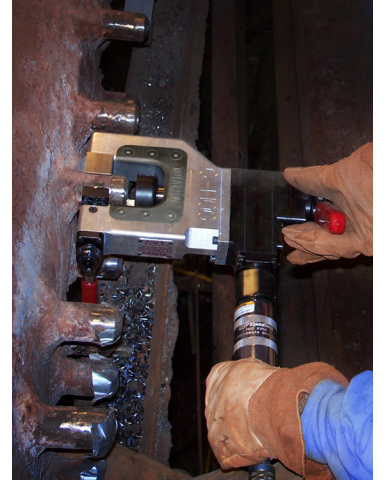
The C-HOG is ideally suited for beveling small bore heavy wall tubes with a high percentage of chrome, stainless steel and other hard alloys.