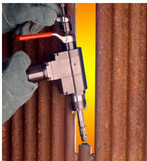
Only 1.5" wide for single boiler tube beveling