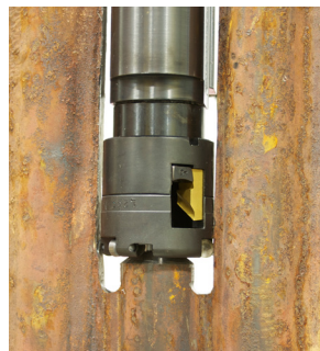
Remove membrane from between tubes