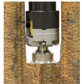
Remove membrane and overlay/cladding from between tubes