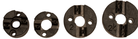
Cutterheads feature the EscoLock Blade Lock System that hold the Cutter Blade rigidly, reduce vibration and heat resulting in superior Cutter Blade life without cutting oils.